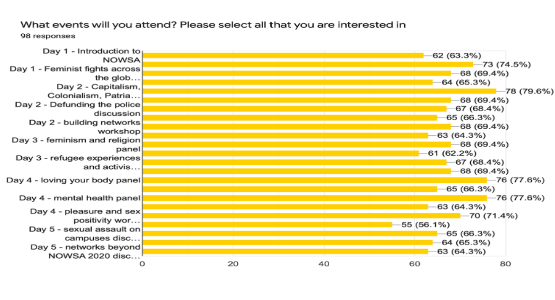
Figure 1: Registrations by Section